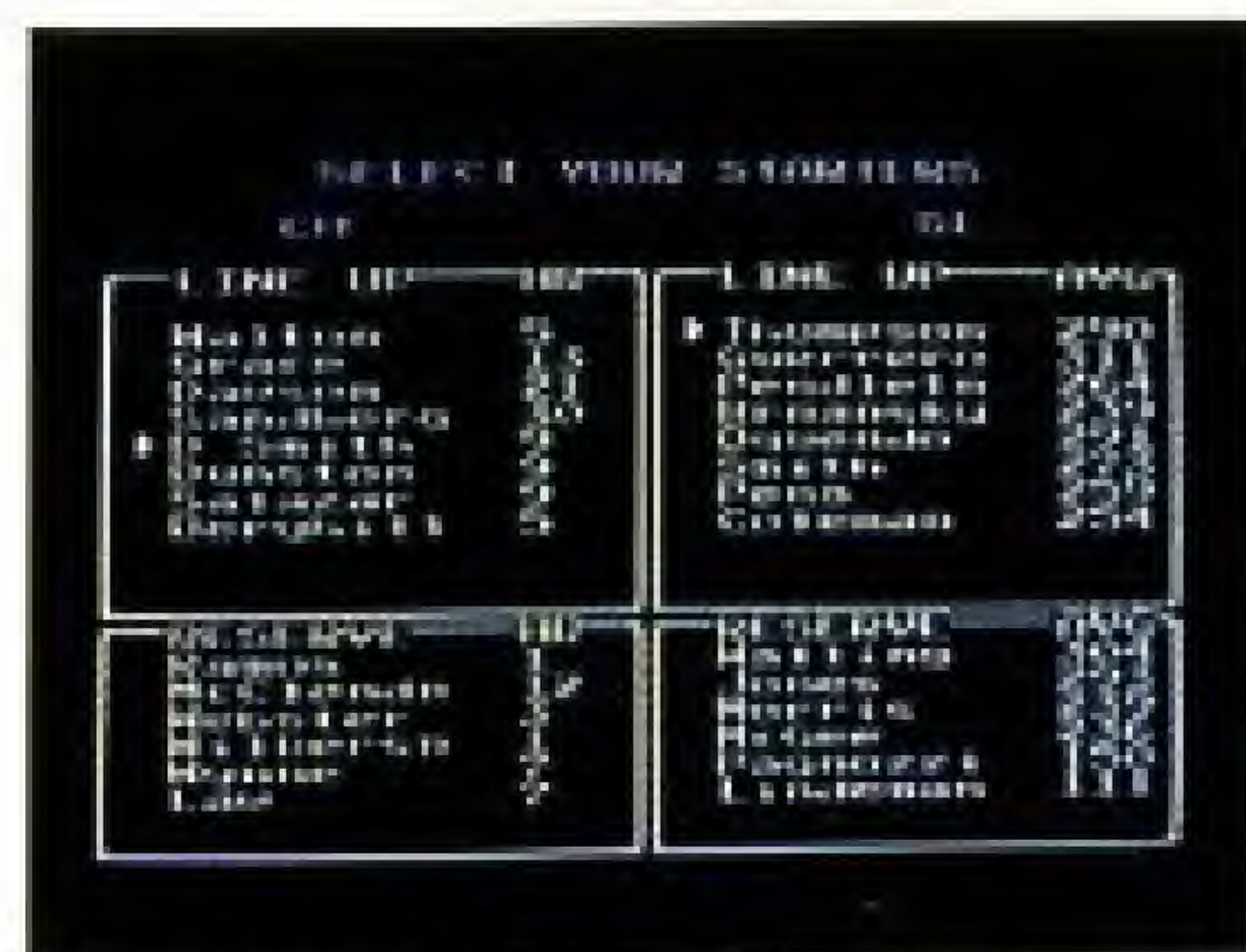
Select your starting lineup.

To select your starting line up: Move the cursor with the control pad.